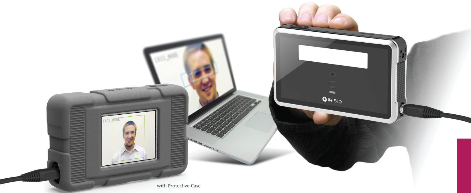
with Protective Case