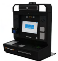
Civil ID Solutions

Discover the efficiency of NextgenID's PRESENCE Station, integrated, with Iris ID iBar600 for Supervised Remote Identity Proofing (SRIP), ensuring precise identity proofing and verification across IAL levels 1-3 with ease and accuracy.